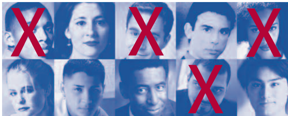
Approximately 4 out of 10 U.S. AIDS deaths are related to drug abuse.

A nyone is vulnerable to contracting HIV. And while injecting drug users (IDUs) are still at great risk of contracting HIV/AIDS, anyone